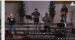
After updates (Feb. 2022)

Check out the archived services on our YouTube channel to see (and hear!) the difference.