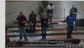
Before updates (Dec. 2020)

While we were displaced from Asbury sanctuary for a several weeks, we made some updates to our media and sound equipment to create a better in-person and online worship experience.